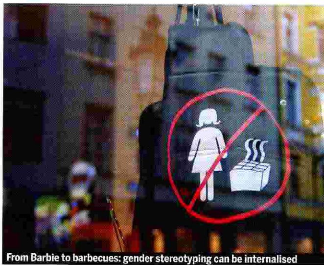
From Barbie to barbecues: gender stereotyping can be internalised

Sarah Ensor Delusions of Gender is published by Icon Books, £14.99